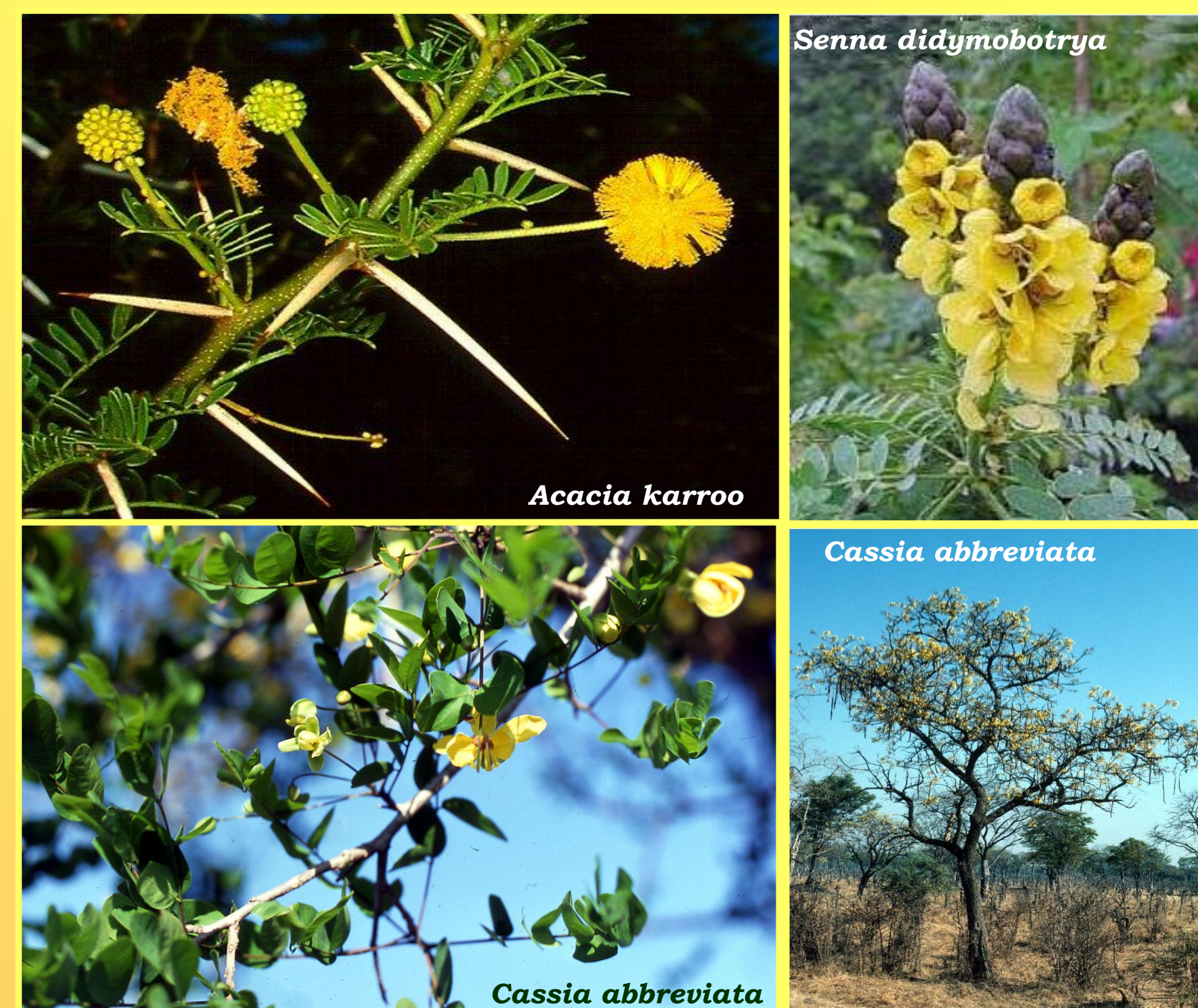
Figure 1- Some of the most active plants. [Adapted from 7]

In this communication, we are reporting on the in vitro antimicrobial activity of some plants used in traditional medicine in Africa.